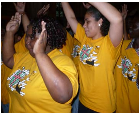
The spirit of youth!